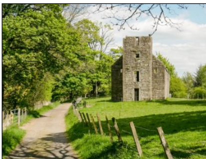
The Collegiate Church